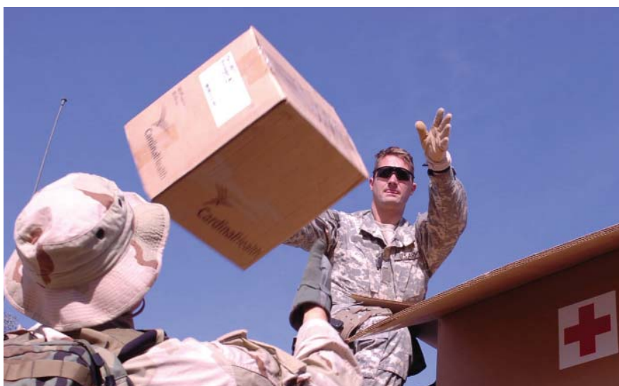
U.S. Army special operations medical personnel unload medical supplies during a U.S. Iraqi medical civil-military operation in Ash Sharqat, Iraq. The operation brought U.S. military medical providers together with Iraqi doctors to provide free medical care.

“These are key operations for us to conduct in order to give that positive presence Special Forces has had throughout the world for decades now,” he said.