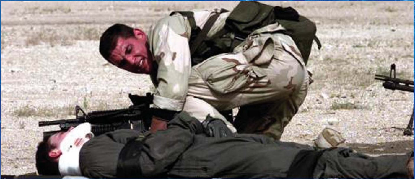
A SEAL medic readies a wounded teammate for evacuation to a medical treatment facility.