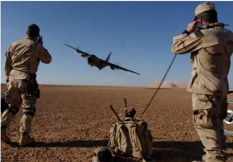
After establishing a runway and clearing air space, Combat Controllers give a C-130 take off clearance while conducting air traffic and control procedures.