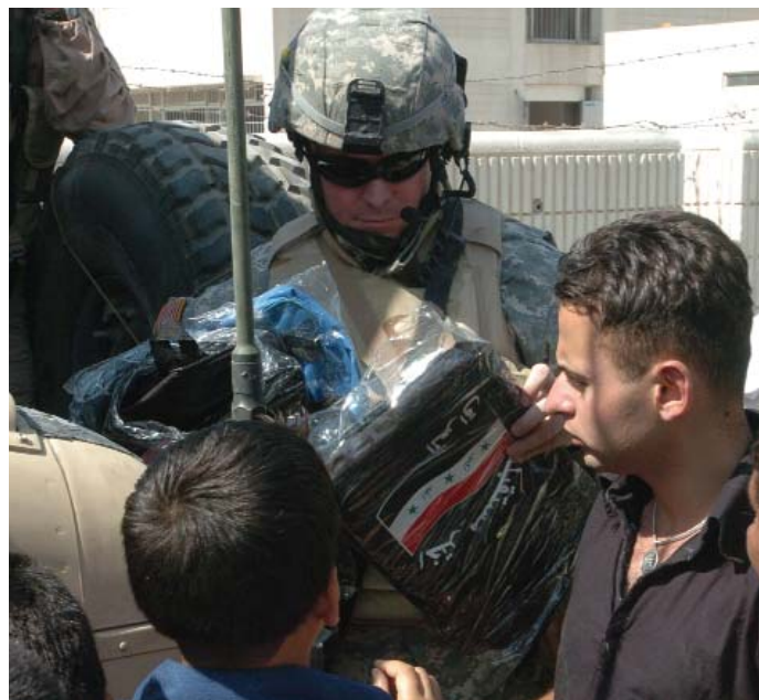
Psychological Operations Soldier hands out book bags to local children in Baghdad, Iraq.