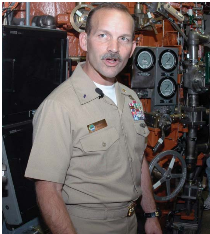
Diver Chief Warrant Officer Steve Reinagel, Naval Special Warfare Group 3, explains the new lockout chambers which will be used by SEAL teams aboard the USS Florida, May 17.

Conversion of the ballistic missile tubes for use as diver lockout chambers enable them to accommodate up to nine men. The diver lockout chambers are the underwater staging areas for SEAL missions. Tubes one and two are the lockout chambers which are broken into three vertical sections with the top section being the release point into the sea.