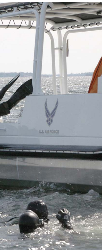
Combat Dive Course students dive backward from their boat into the gulf waters.