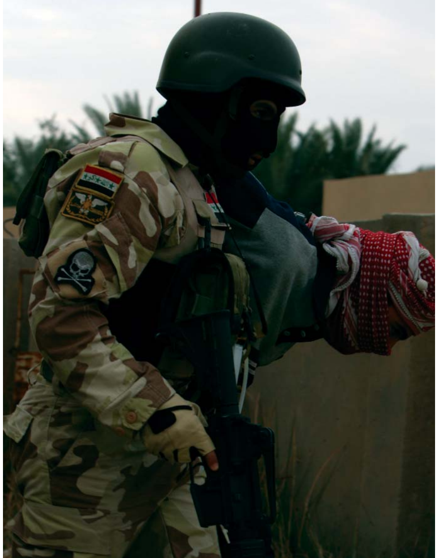
An Iraqi special operation forces soldier escorts a detainee after a recent raid searching for insurgents in Baghdad.

No ISOF soldiers or U.S. forces were killed during the operation. One ISOF soldier was wounded in the