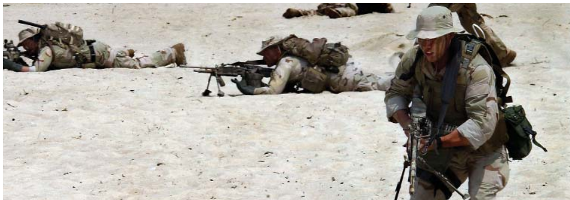
SEALs demonstrate small unit tactics.

The mission statement continues, "While maintaining the offensive in the Global War on Terrorism, we will simultaneously seek to transform the command into an organization that continues to leverage every possible advantage." SOF training and exercises are undergoing constant improvements, and the command looks to the DODs training transformation effort as a prime opportunity to demonstrate its current level of readiness and as a place to hone or test new concepts. How to transform — how to identify and develop those capabilities SOF will need to be a useful part of the future joint team while maintaining the readiness to shape and respond to the world today — is a significant linchpin. Methodically and intentionally looking to the future through various lenses will better position USSOCOM to carry out its lead role in the war on terrorism and its Service-like responsibilities to man, equip, and train special operations. More importantly, it will lead to SOF warriors with stronger capabilities, better warfighting concepts, and improved joint operational skills that serve the combatant commanders and the Nation.