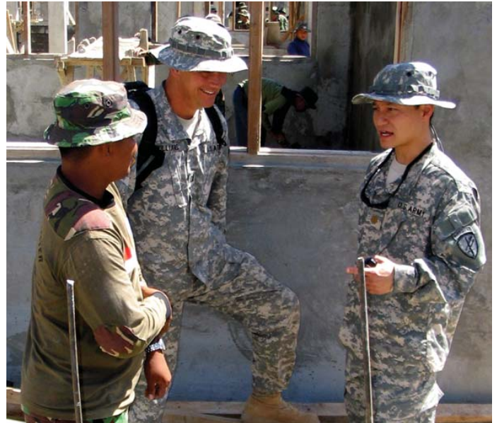
Civil Affairs Planner, right, and CA Team Leader, middle, both with the 96th CA Battalion, Bravo Company, Fort Bragg, N.C., talk with an Indonesian officer in the village of Teluk Dalam on the Indonesian Island of Nias.

According to the U.S. team members, local families had to send their children out to farther schools, placing more stress on them. This project, they say, will turn that around ten-fold.