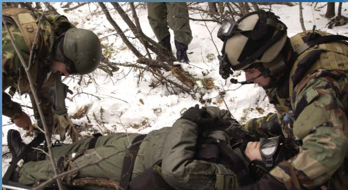
Special operators ensure a rescued pilot is secured to a transport before evacuating to a safe area in a combat search and rescue training during the Cope Thunder exercise at Eielson Air Force Base, Ala., Oct. 18, 2006.

During the care under fire phase, the need for mission personnel to assist in ensuring a successful outcome to the engagement may take priority over immediate medical care. The combat medic may be required to return fire before rendering care in some casualty scenarios. In addition, in the words of a former commanding officer of SEAL Team Four, "I also expect the casualties to continue to return fire as long as they are able to do so." Also during this phase, it is important to try and prevent the casualty and other mission personnel from receiving further injuries. The most important medical consideration of this phase is to control severe extremity hemorrhage with a tourniquet and to stop severe torso hemorrhage with a HemCon