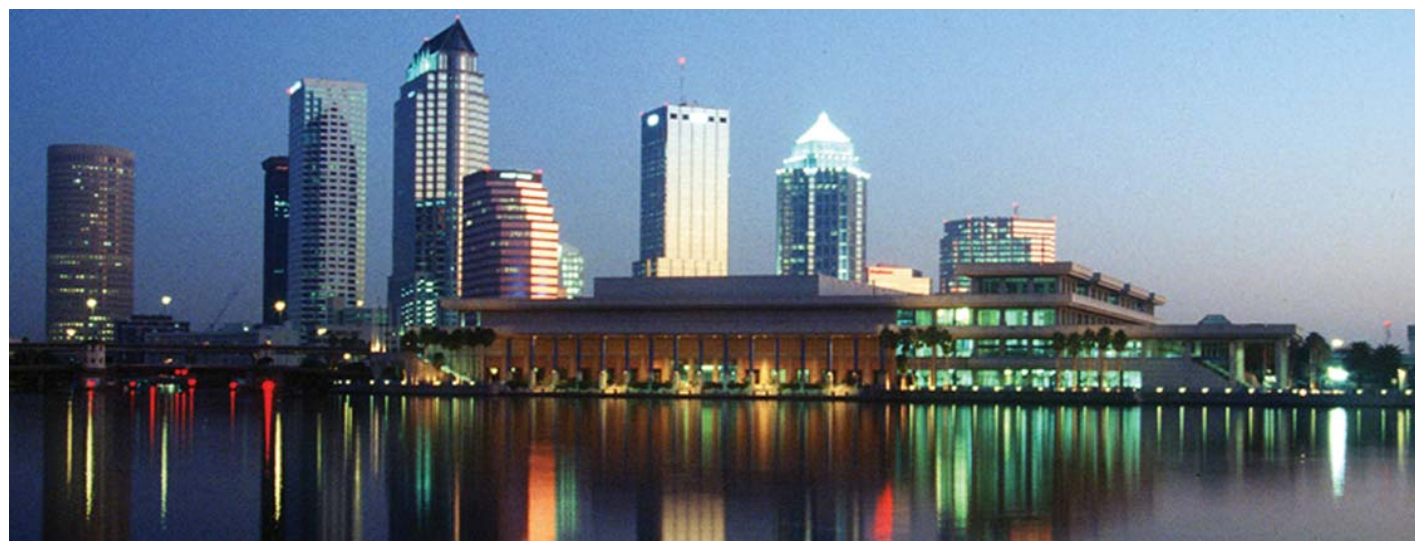
A view of the Tampa Convention Center.

USSOCOM will not sponsor an APBI in 2007. In 2007, USSOCOM will hold SOF Week in April and the week’s total focus will be the command’s 20th anniversary.